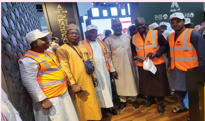
With Members of association of Hajj and Umrah Operators (Abuja Branch) during the conference held in Jeddah, Saudi Arabia

Yes, I went, I witnessed and I have acquired more insight into the hajj admirative mechanism and reportage. May Almighty Make this year a success for Nigeria pilgrims Ameen.